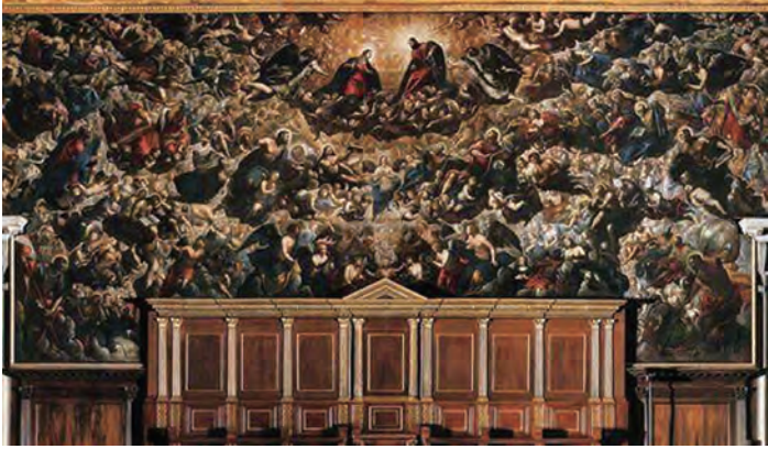
Fig. 6: Jacopo Tintoretto, Paradise , after 1588 74 ft × 30 ft, Oil on canvas, Doge’s Palace, Venice