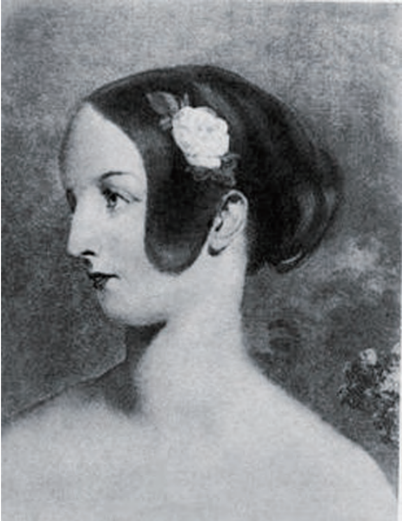
Fig. 1: Mary Scott Hogarth, 1820-1837: Dickens's Beloved Sister-in-Law