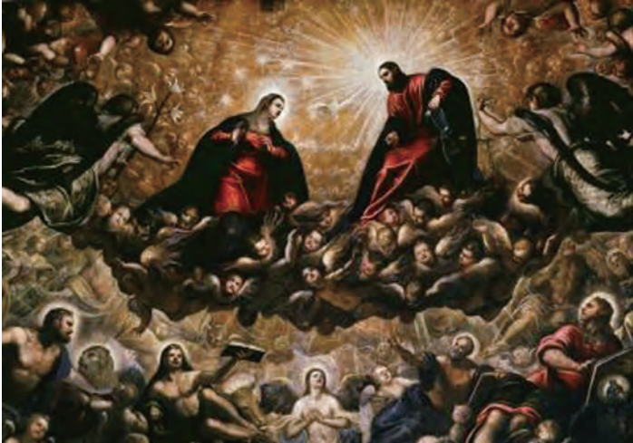
Fig. 7: Detail from Tintoretto’s Paradise