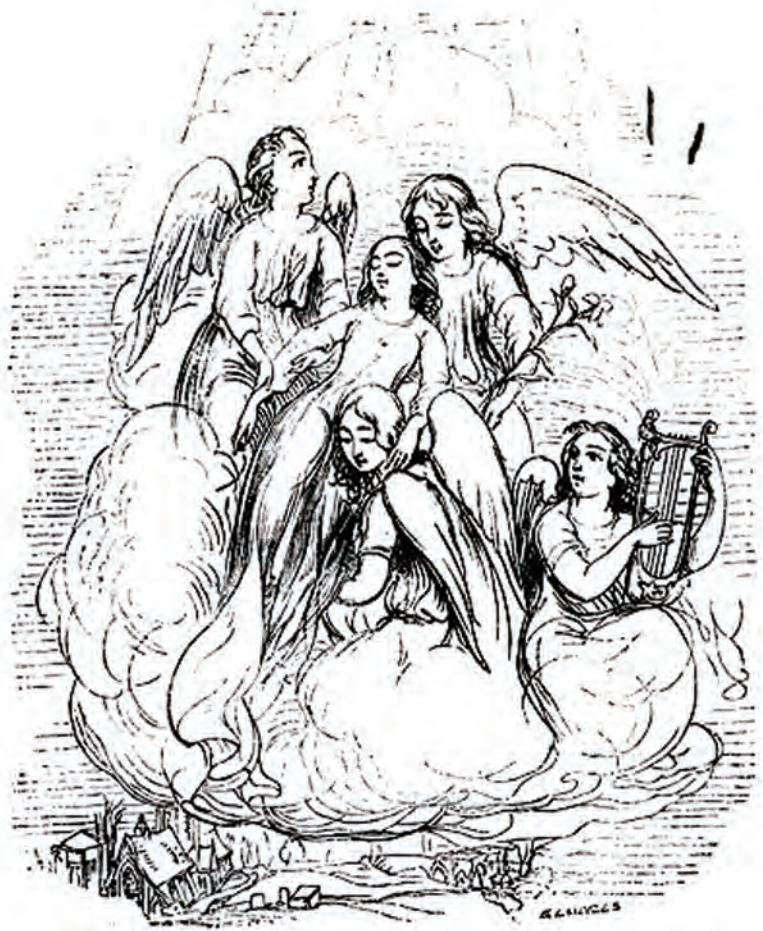
Fig. 2: The Spirit's Flight (The soul of Little Nell ascending) by George Cattermole Wood-engraving. The Old Curiosity Shop , Ch. 73.