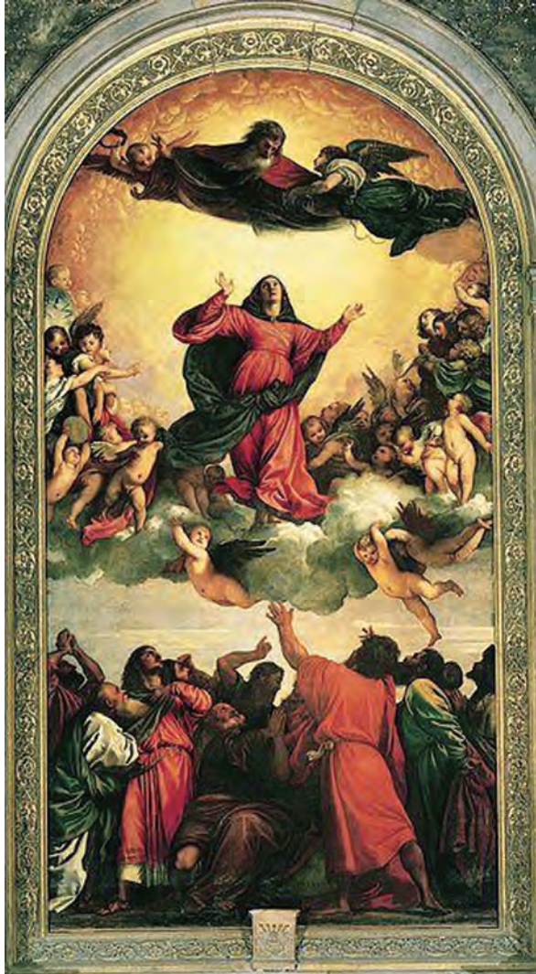
Fig. 5: Titian, The Assumption and Consecration of the Virgin , 1516–1518 690 cm × 360 cm, Oil on panel, Basilica of Santa Maria Gloriosa dei Frari, Venice