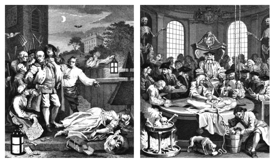
[C-3] Cruelty in Perfection