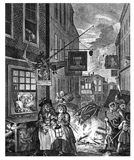
[E] 'Night' of the Four times of the Daywq