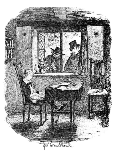
Il - 1