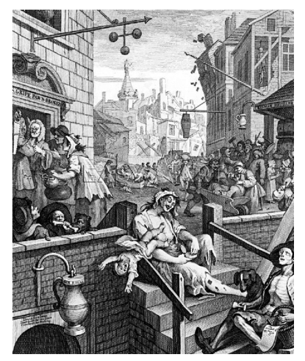
[D] Gin Lane