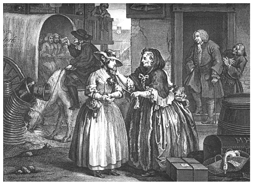
[B] The first plate of Harlot's Progress