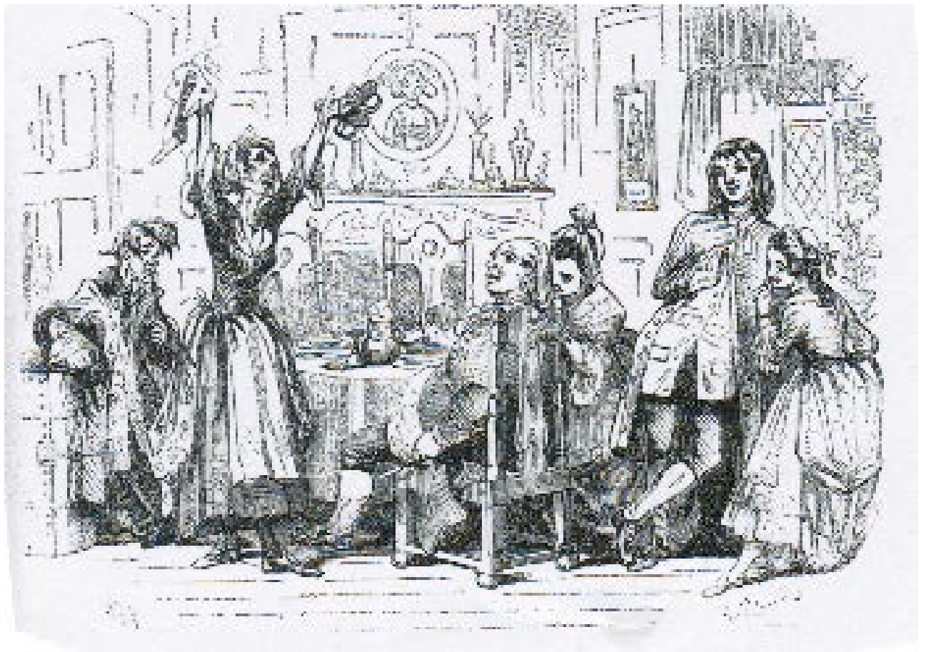
图 3 Barnaby Rudge 669